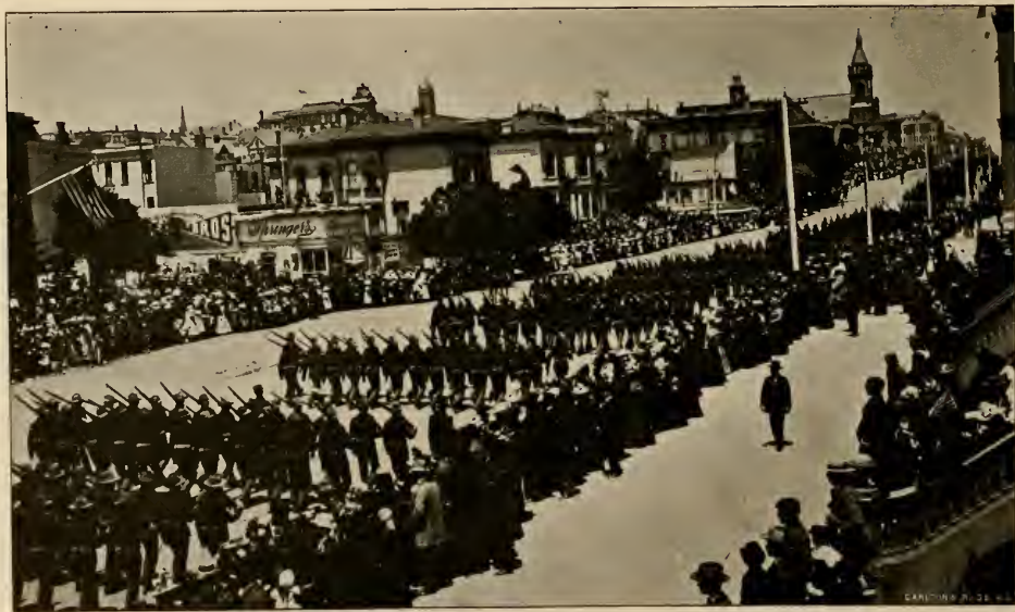
LAST PARADE OF THE KANSANS BEFORE LEAVING SAN FRANCISCO.